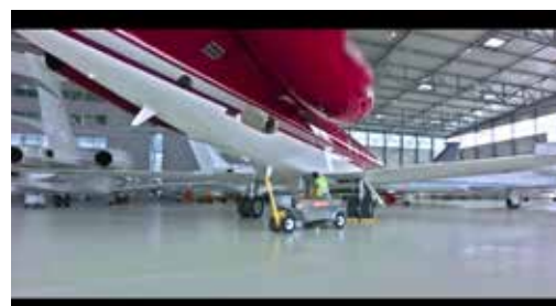
Video Water & Toilet services