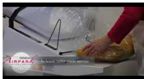
Video Laundry & Dishes