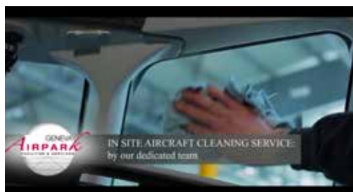
Video Aircraft cleaning